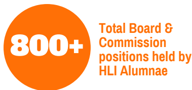
■ Number of HLI Alumnae.

100% of HLI Alumnae are civically engaged. 90% have held a community leadership position and nearly 70% have served on a board or commission.